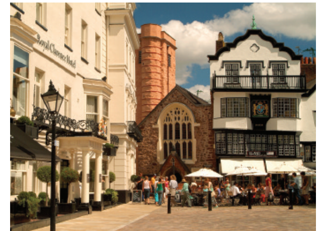
The Royal Clarence Hotel, Cathedral Close