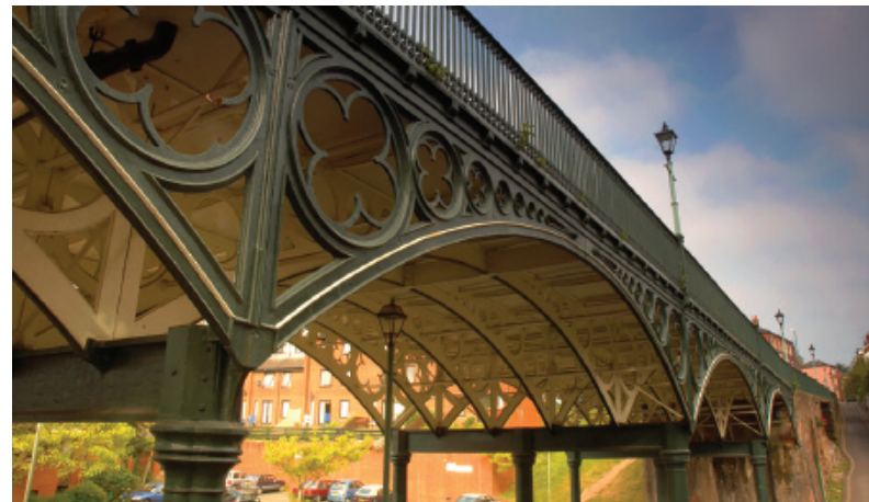
Above: Iron Bridge