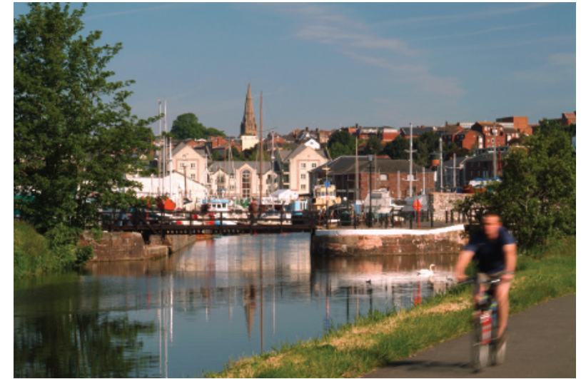
Canal and City View